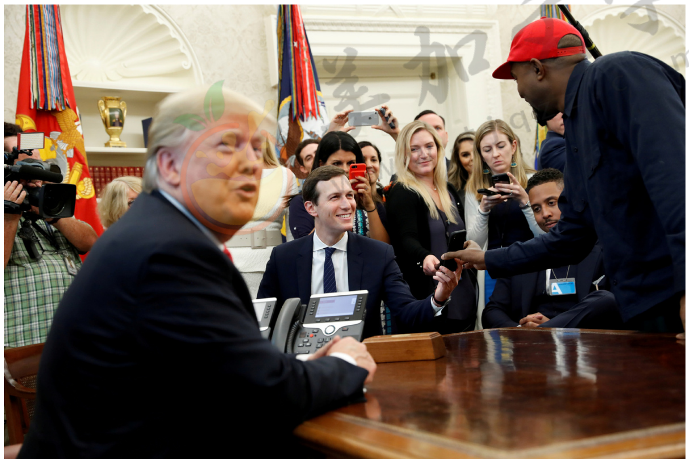
FILE PHOTO: Rapper Kanye West shows a photo on his mobile phone to White House senior adviser Jared Kushner during a meeting with US President Donald Trump to discuss criminal justice reform at the White House in Washington, US, October 11, 2018.

?????????????????????.?????????????.???????????