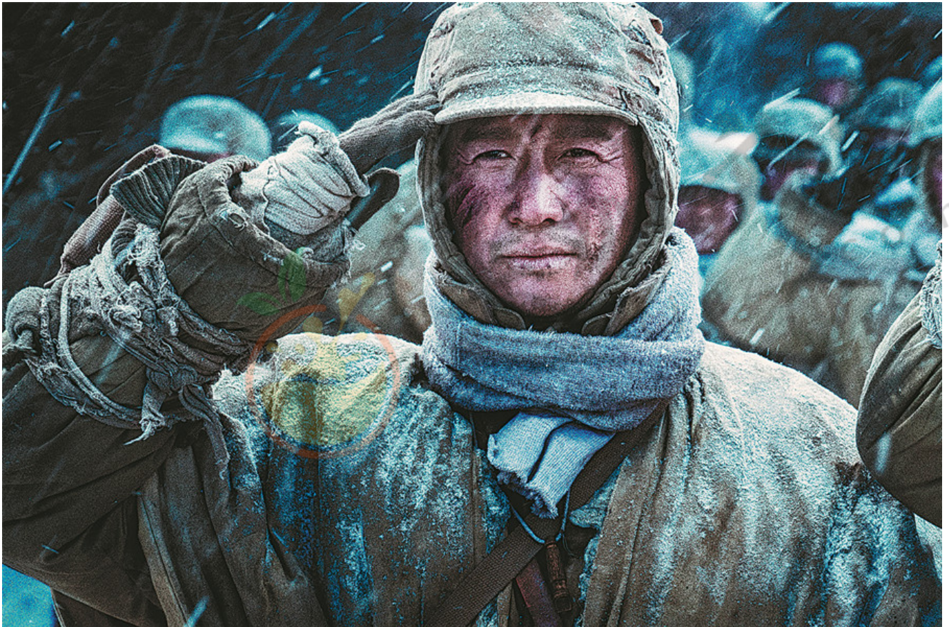
A still from the film, The Battle at Lake Changjin.

2021年恰逢中国共产党成立100周年，在此时间节点上，献礼片成为今年影视行业的关键词。在今年播出的献礼建党百年佳作中，《觉醒年代》无疑是话题度和讨论度最高的。此外，《大浪淘沙》、《长津湖》等影视剧也备受观众喜爱。下面我们盘点了2021年的十部优秀红色影视剧，一起来看看吧。