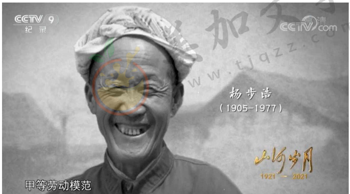
A scene from the TV drama Shanhe Suiyue

这部电视剧的拍摄场景有600多处。此外，剧中制作了一些中共历史上重要遗址的复制品，如嘉兴“南湖红船”、陕西延安的窑洞，以逼真还原历史。