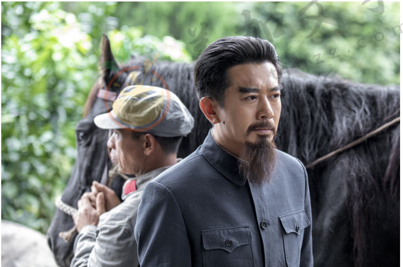
A scene from the TV series Jue Mi Shi Ming (The Confidential Missions).

《山河岁月》选取了100个关键场景、精彩瞬间和典型人物，讲述了100个生动的故事，展示了中国共产党在领导国家重大变革中的关键作用和人民取得的辉煌成就。