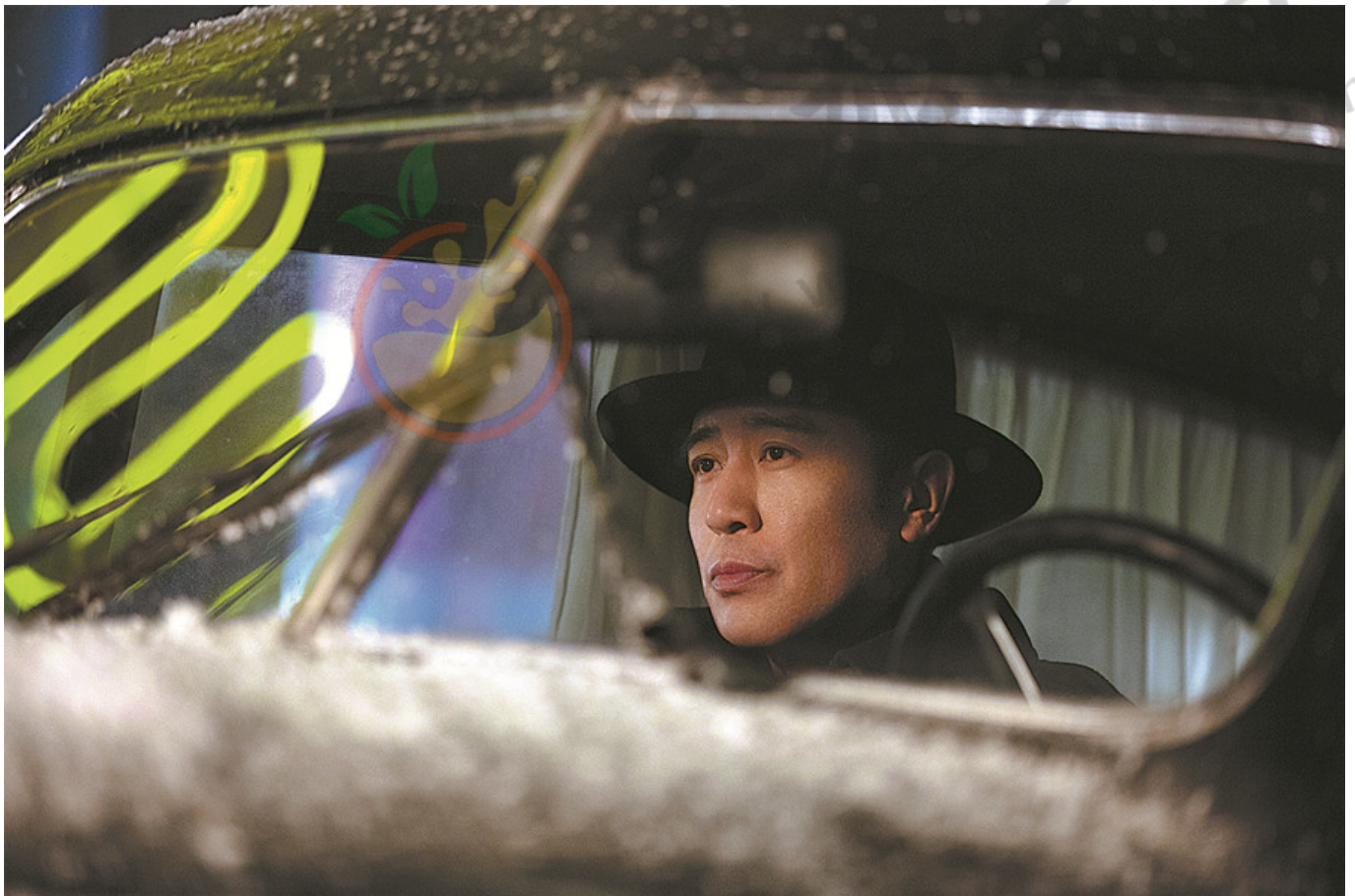
Yu Hewei, a leading actor in Cliff Walkers.

这部176分钟的电影耗资13亿元，是同类国产电影中制作成本最高的一部。截至11月24日，该片总票房超过56.9亿元人民币，取代《战狼2》成为中国影史票房第一的电影。