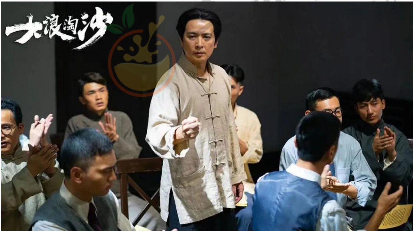
A scene in the revolutionary TV drama Da Lang Tao Sha (Great Waves Sweep Away Sand). [Photo provided to China Daily]

该剧以毛泽东、周恩来等历史人物为主角，共描写了400多个人物，交织了许多历史事件、冲突和会议，它们对推动中国共产党的革命胜利至关重要。