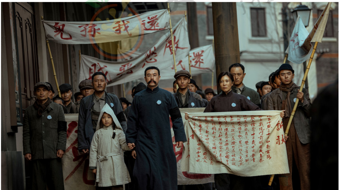
A scene in the film The Pioneer .

该剧在2月份首播后一炮而红，大陆知名影评网站豆瓣评分9.3分，近27万用户已看。6月中旬，央视将该片引入线上播出后，油管播放量超过276万。