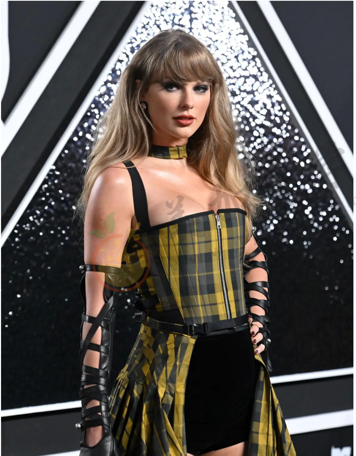
Taylor Swift went full punk on the VMAs 2024 red carpet Wednesday, wearing a plaid